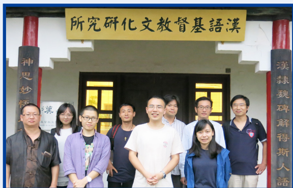
Visiting Period: Jun to Dec 2016